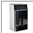
S.6083 RECESSING BOX for BLINKER 190 x 300 mm Depth 130 mm