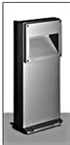
S.4350 BOLLARD Die-cast aluminium column. Base 240 x 160 mm H = 550 mm Order luminaire EOS SQUARE separately.