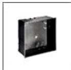
S.4343 RECESSING BOX SQUARE 217 x 187 mm. Width 100 mm.